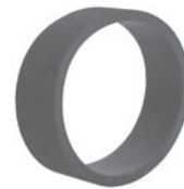
Flat Seal Gaskets